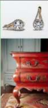
Photo Lessons and Coaching

difikent@aol.com | 941.685.9925 www.appraisal246.com